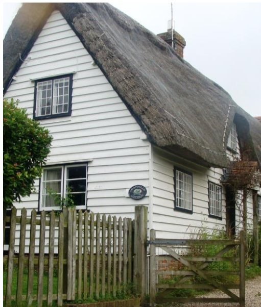
Picture 8. Chappells Cottage, Thatched roofs are an important feature in Anstey.

5.13. Chappells Cottage, Cheapside - Grade II. Later 17th century, north bay later. Timber frame on red brick plinth, white weatherboarded with a steep thatched roof. 2 eyebrow dormers on east with cast iron casements, and plank door under gabled tiled hood. Interior has axial beams and wide fireplace.