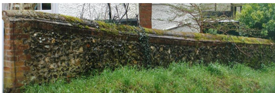
Picture 23. Wall of brick and flint construction to front of Clare Cottage Snow End House .

5.38. Wall to frontage of Clare Cottage Snow End House . Approx. 1m in height of brick and flint construction with rounded brick capping detailing.