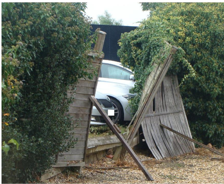
Picture 29. Broken boundary fence between No. 1 Buryfield and adjacent PH detracts. The owner has promised a positive outcome which has now been implemented.