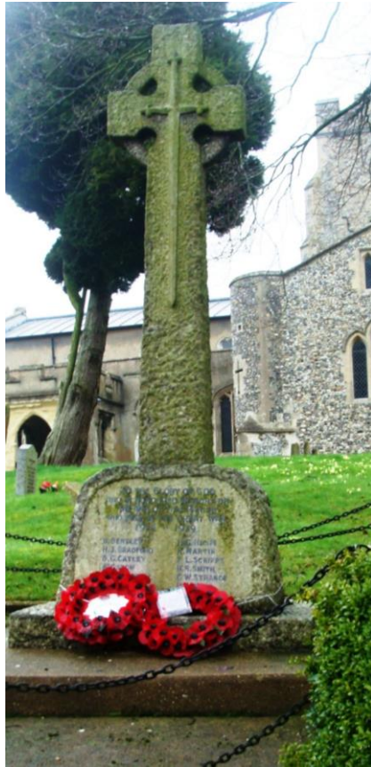
Picture 24. Fine stone War Memorial believed dedicated in 1921, see also Picture 1.

5.40. Eastern boundary of church presumed brick/flint wall. Partly repaired but partly heavily covered in ivy. Condition of wall beneath ivy unknown. Suggest careful removal of ivy and if necessary initiate repairs.