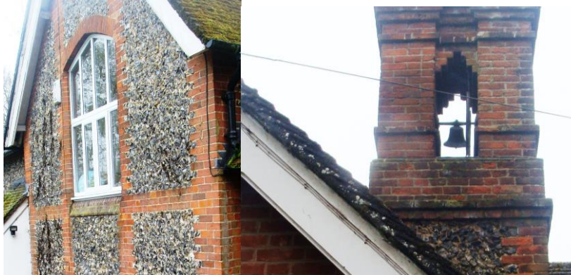
Picture 19. Historic elements of original 19th century school building which make an historic and architectural contribution to the street scene.

5.33. School building in part. Parts of the old school remain and are visible from the main road. The brick and flint front elevation and bell tower are pleasing features and worthy of retention. However various extensions and additions elsewhere on the site are visually less satisfactory.