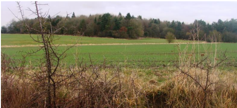
Picture 321. One of two linear strips of agricultural land with undefined northern boundaries clearly forms part of the wider agricultural landscape and as such their exclusion is consistent with Historic England advice.

(c) Exclude two narrow linear areas of open countryside to north of Mill Lane and north of Anstey House. These pockets form part of the wider landscape and farmland.