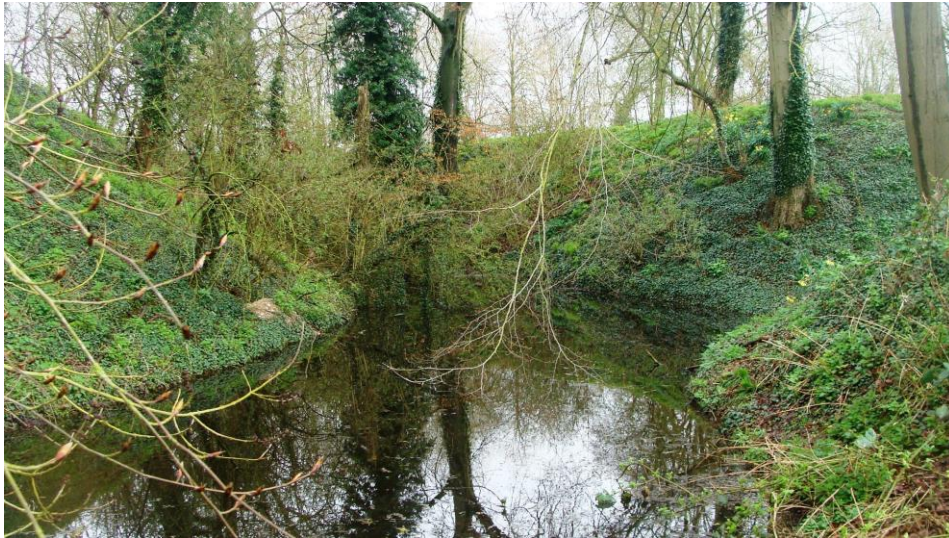
Picture 12. Part of the Anstey Motte and Bailey site, an important Scheduled Ancient Monument attributed to Eustace Count of Cologne.

area of the bailey, just east of the motte, is a square-shaped landscaped mound surrounded by a dry ditch. Its position and shape are incongruous with the bailey and it is considered to be a later ornamental addition. In 1902 excavations carried out by R. T. Andrews on the eastern edge of the motte summit revealed a trapezoidal foundation of flint dug circa 46 cm deep into the boulder clay. Fragments of tile and 13th century pottery were also found. The castle is attributed to Eustace, Count of Cologne, who held the manor at Domesday. In 1218 Nicholas de Anstey was ordered to reduce his castle which was in the king's hands in 1225.