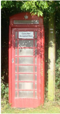
Picture 9. 20th century listed telephone kiosk. Would benefit by undertaking minor repairs and cleansing and if necessary repainting.

5.15. Well Cottage - Grade II. 17th century, matching north part 1865. Timber frame, white weatherboarded with steep thatched roof. A 1½ storeys, 3 cells, end chimneys plan house facing east. 3 dormer windows of 2-light casements cut into thatch at eaves. Lean-to weatherboarded and thatched porch central to older south part.