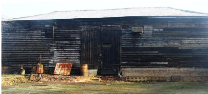
Picture 15. 19th century agricultural barn of historic and architectural interest associated with High Hall Farm probably from mid/late 19th century.

5.29. Agricultural barn at High Hall Farm. Probably of mid/late 19th century date. Principally weatherboarded with slate roof. Largely unaltered with large central entrance to front elevation. An Article 4 Direction to provide protection for selected features may be appropriate subject to further consideration and notification.