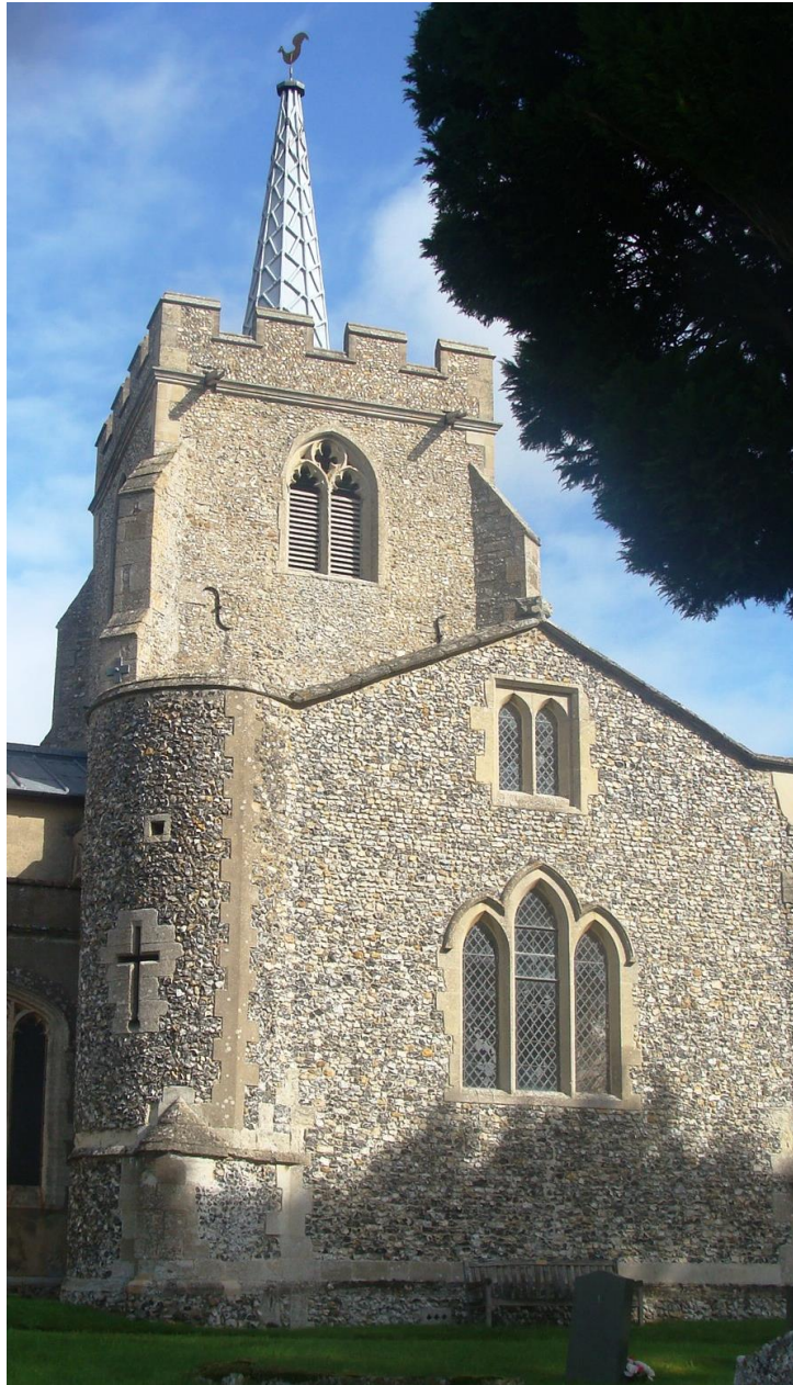
Picture 3. Church of St George which dates from the 12th century.

5.9. Lych-gate Grade II. Lych-gate incorporating a lockup. 15th century or earlier, lockup enclosed in flint and brick walls in 1831. Timber frame on red brick sill walls uncoursed flint with grey brick quoins to lockup, and hipped old red tile roof with gablets. A small, single-storey rectangular structure... the square lockup occupies the east 2/5ths. 3 heavy chamfered square posts in line on the central long axis support the rest of the structure. Arched knee-braces in the head of the central opening. In use as the parish cage up to the early 20th century.