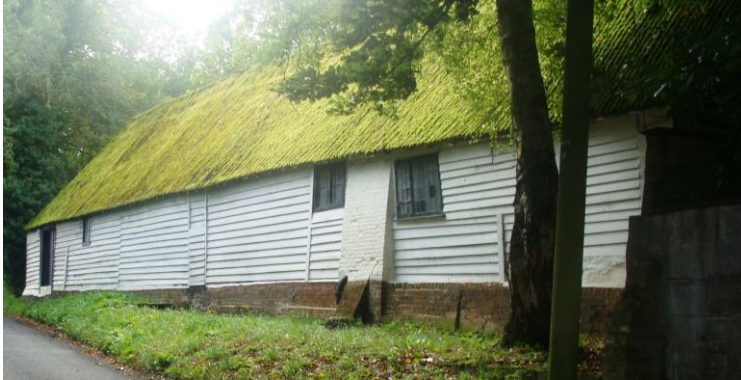
Picture 7. Barn at Anstey House. A prominent historic feature in the street scene.

5.13. Chappells Cottage, Cheapside - Grade II. Later 17th century, north bay later. Timber frame on red brick plinth, white weatherboarded with a steep thatched roof. 2 eyebrow dormers on east with cast iron casements, and plank door under gabled tiled hood. Interior has axial beams and wide fireplace.