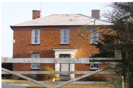
Picture 13. High Hall a prominent 19th century building of good proportions worthy of retention.

5.27. High Hall, Mill Lane. Of mid/late 19th century date. Brick construction with hipped slate roof; 2 No. chimney stacks. 3 range vertical sliding sash windows to first floor. Central decorative portico (not examined or dated) and entrance door with flight of steps. An Article 4 Direction to provide protection for selected features may be appropriate subject to further consideration and notification.