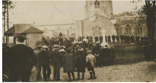
Picture 1. War Memorial 1921, presumed as being the dedication and unveiling ceremony.

3.13. Plan 1 shows the existing Conservation Area plotted on historic map (appears disjointed) dating from 1874-1894.