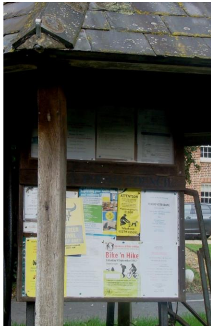
Pictures 5-6. As the listed building says this is A picturesque village feature of special social and technological interest . However there is an opportunity to consider inexpensive improvements that would much improve the quality of this most unusual feature. In the authors opinion the notice board hoarding detracts.

5.12. Barn at Anstey House - Grade II. Late 16th century west part, late 17th century east part. Timber frame on red brick sill, white weatherboarded on south, rear (north) side roughcast on road side. Steep, hipped thatch roof. A long barn with low side-walls and tall roof. 18th century leaded casement windows to convert it to a coachman's house. Original thatched roof no longer exists - replaced.