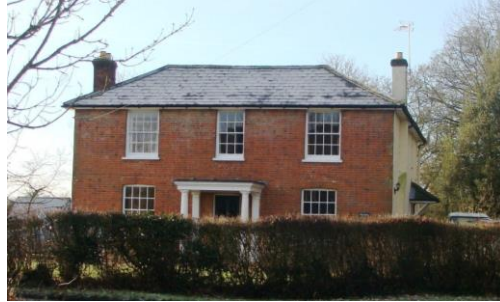
Picture 16. The Hale - makes a worthwhile architectural and historic contribution to the conservation area in this location.

5.31. The Union Chapel. Dating from the early 20th century. Of brick construction with slate roof and decorative ridge tiles. Central entrance door to front and three range window to side. This building seems to have replaced an earlier original Primitive Methodist chapel to the north, now demolished. Commemorative stone reads This stone was laid to the glory of God by J. C. Wilkerson Esq. October 27 1902 . This building and window openings with central entrance and brick hood moulding and label stops is/are most worthy of retention.