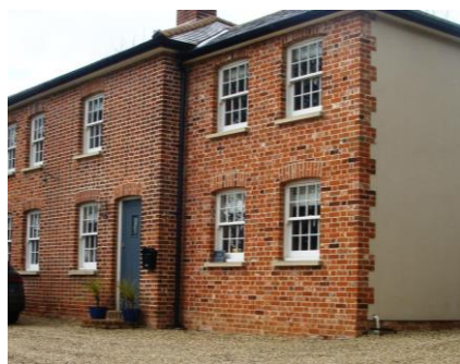
Picture 21. Elm Cottage A sensitive design and use of materials of new extension is successful and in keeping with the original.

5.35. Elm Cottage. From preliminary consideration (albeit no detailed site inspection or discussion with owners, see reference at para. 1.7) and historic map inspection, the southern element of Elm Cottage is interpreted as being late 19th century of brick construction with hipped roof and centrally located chimney. The northern extension, although quite prominent is well designed and in keeping with the original in terms of design and materials. Therefore the building as a whole makes an important architectural and historical contribution and on balance the whole is considered worthy of retention. An Article 4 Direction to provide protection for selected features may be appropriate subject to further consideration and notification.