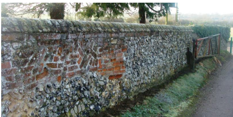
Picture 22. Good quality 19th century wall at High Hall Farm worthy of retention and protection.

5.37. Flint wall at High Hall Farm. Prominent feature in the farm complex. Of flint construction capped with typical 19th century rounded brick detailing. Not adjacent to the highway and less than 2m in height and thus unprotected by conservation area legislation. An Article 4 Direction to provide protection for selected features may be appropriate subject to further consideration and notification.