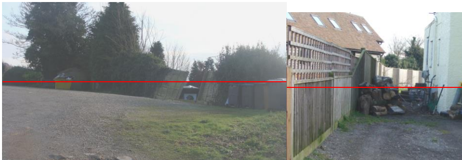
Pictures 29-30. The Blue Fiddler PH – broken boundary fence and open storage area detract.

5.52. Elements out of character with the conservation area. The site offence adjacent to The Blue Fiddler PH is in the centre of the village and a visual focal point. The site is untidy in some respects and would benefit from modest improvements including repair and replacement. Discussions have now taken place with the owner who has promised positive action. of part broken fence. This has now been implemented.