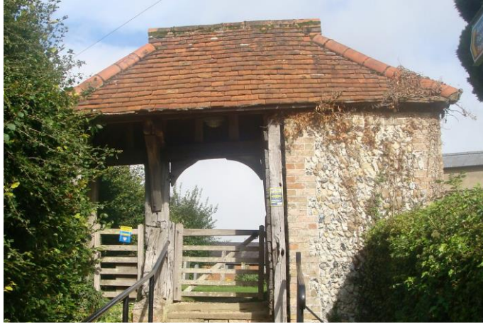
Picture 4. Lych-gate and lockup, the latter being in use until the early 20th century.

5.10. Anstey Hall - Grade II. Manor House. Mid 17th century south range, earlier north range, early 19th century east garden front. Timber frame plastered, plastered red brick early 19th century casing to south front, and steep hipped tiled roofs. A large square 2-storeys house. On the site of the capital messuage ( house and outbuildings ) which replaced the castle as the Caput ( head ) of the Manor.