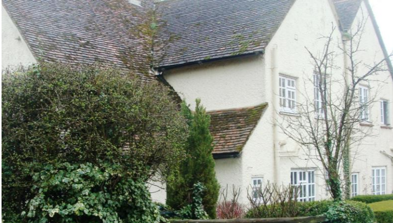
Picture 20. Church Gate Cottage and Anstey Hall Cottage, St Georges End.

5.35. Elm Cottage. From preliminary consideration (albeit no detailed site inspection or discussion with owners, see reference at para. 1.7) and historic map inspection, the southern element of Elm Cottage is interpreted as being late 19th century of brick construction with hipped roof and centrally located chimney. The northern extension, although quite prominent is well designed and in keeping with the original in terms of design and materials. Therefore the building as a whole makes an important architectural and historical contribution and on balance the whole is considered worthy of retention. An Article 4 Direction to provide protection for selected features may be appropriate subject to further consideration and notification.