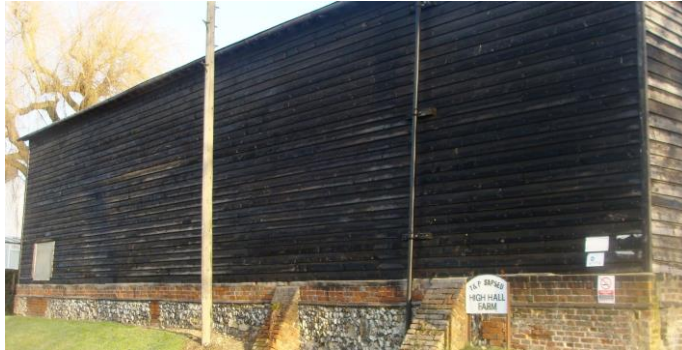
Picture 14. Prominent barn in the local street scene - High Hall Farm worthy of retention.

5.29. Agricultural barn at High Hall Farm. Probably of mid/late 19th century date. Principally weatherboarded with slate roof. Largely unaltered with large central entrance to front elevation. An Article 4 Direction to provide protection for selected features may be appropriate subject to further consideration and notification.