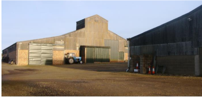
Picture 340. Modern agricultural barns to north of High Hall Farm to be removed from the conservation area because they are of no historic or architectural value.

(c) Exclude two narrow linear areas of open countryside to north of Mill Lane and north of Anstey House. These pockets form part of the wider landscape and farmland.