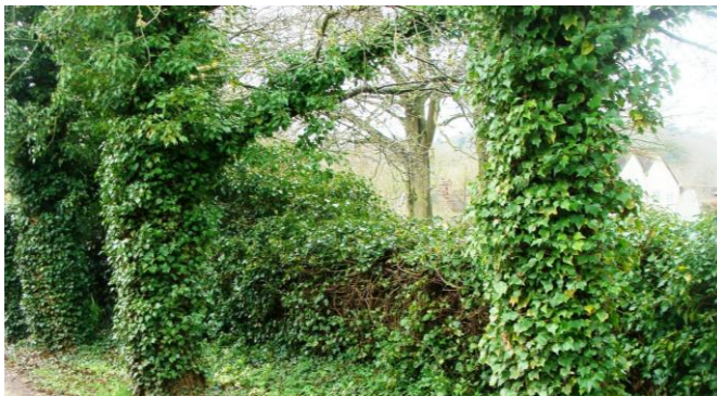
Picture 25. The condition of the eastern boundary of the church boundary wall? is unknown. Suggest explore further and consider implementing any necessary repairs.

5.40. Eastern boundary of church presumed brick/flint wall. Partly repaired but partly heavily covered in ivy. Condition of wall beneath ivy unknown. Suggest careful removal of ivy and if necessary initiate repairs.