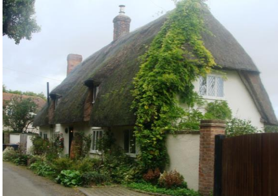
Picture 11. Snow End and Essex Cottage in foreground, part of a group of important listed properties principally dating from the 16th century.

Interior has evidence of former open hall, with slots for braces in bay posts in south bay flanking inglenook.