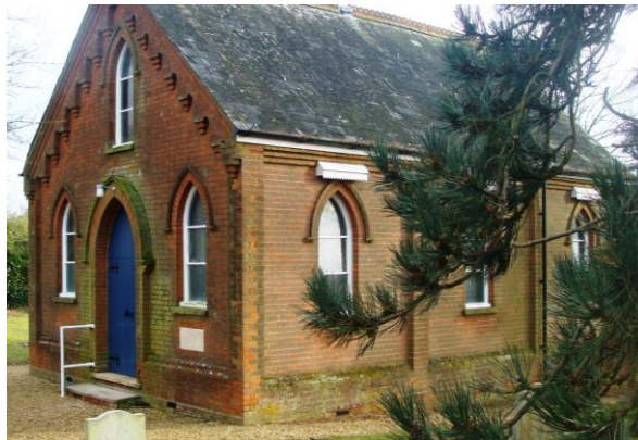
Picture 17. The Union Chapel, of early 20th century date apparently replaced a Primitive Methodist Chapel at Cheapside to the north.

5.31. The Union Chapel. Dating from the early 20th century. Of brick construction with slate roof and decorative ridge tiles. Central entrance door to front and three range window to side. This building seems to have replaced an earlier original Primitive Methodist chapel to the north, now demolished. Commemorative stone reads This stone was laid to the glory of God by J. C. Wilkerson Esq. October 27 1902 . This building and window openings with central entrance and brick hood moulding and label stops is/are most worthy of retention.