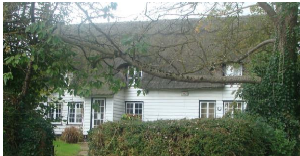
Picture 10. Well Cottage one of a number of important thatched properties in the local street scene.

5.15. Well Cottage - Grade II. 17th century, matching north part 1865. Timber frame, white weatherboarded with steep thatched roof. A 1½ storeys, 3 cells, end chimneys plan house facing east. 3 dormer windows of 2-light casements cut into thatch at eaves. Lean-to weatherboarded and thatched porch central to older south part.