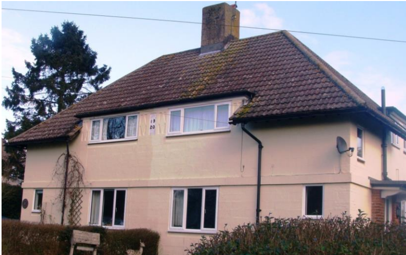
Picture 18. Nos. 1-6 Castle Cottages. Dating from 1920 these properties on balance are considered to be of sufficient quality to be protected and retained.

5.33. School building in part. Parts of the old school remain and are visible from the main road. The brick and flint front elevation and bell tower are pleasing features and worthy of retention. However various extensions and additions elsewhere on the site are visually less satisfactory.