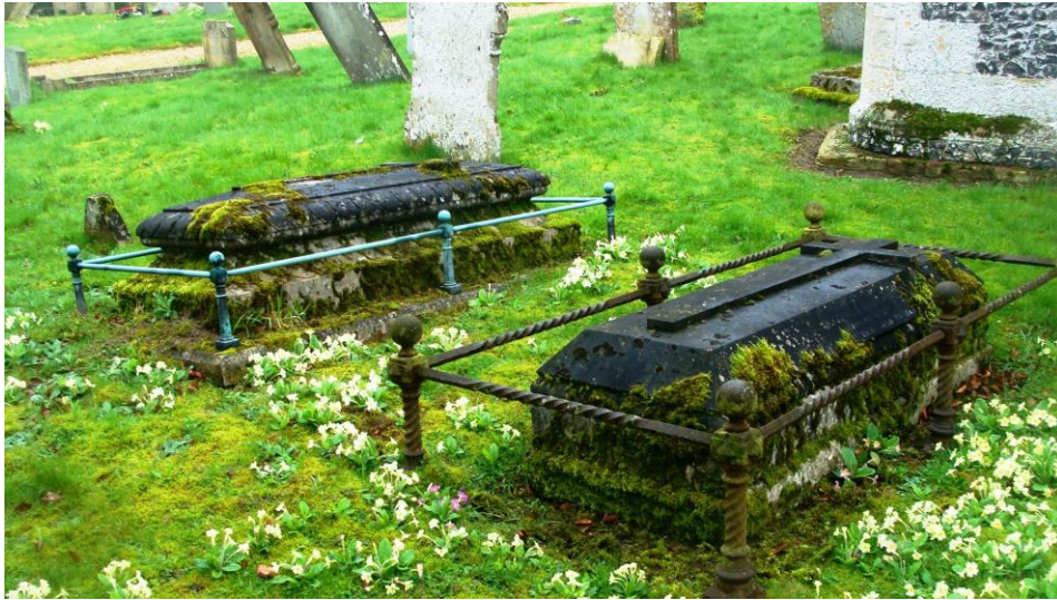
Pictures 27 -28. A verdant churchyard enhanced by spring flowers contains a wide range of interesting tombstones, many dating from the 19th century.

5.45. Small green near Union Chapel. Small triangular Green with maturing trees that forms a small but visually important space in the street scene.