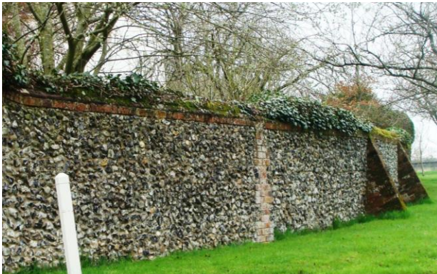
Picture 26. High quality boundary wall to Anstey Hall - a prominent and visually important feature in the street scene.

5.41. Boundary wall to Anstey Hall. Wall of high quality of flint construction with rounded brick capping. Height varies.